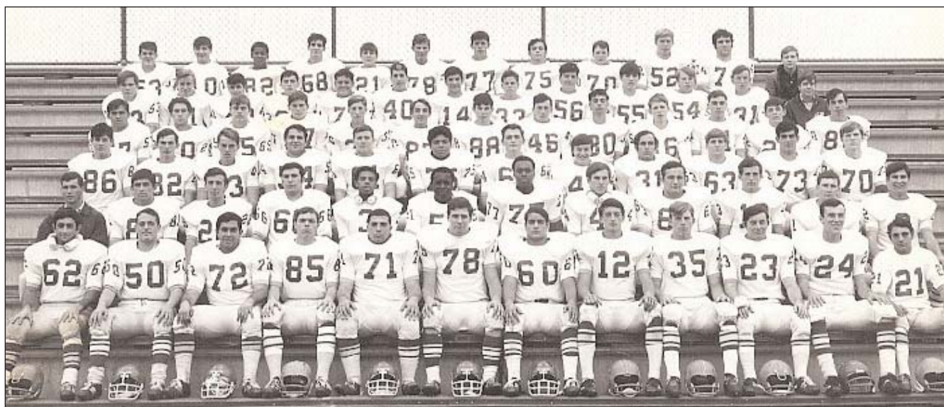
The undefeated 1968 West Haven High football team was voted No. 1 in the New Haven Register poll with a 9-0 record. The National Sports News Service ranked West Haven fifth in the country.