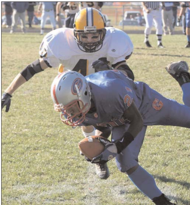
Simsbury Gridiron Club